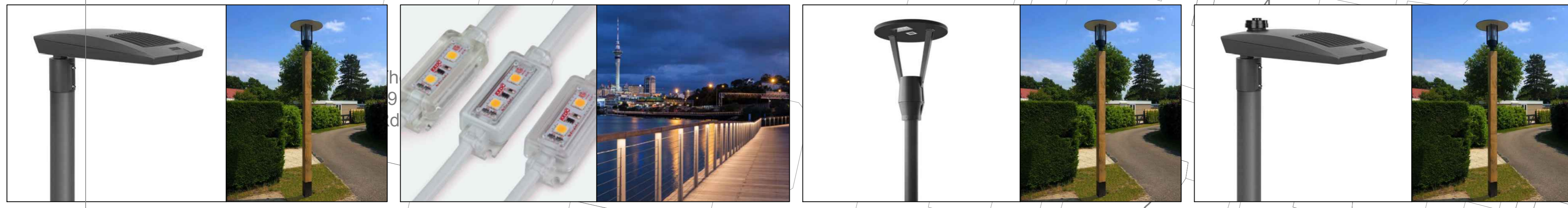
TYPE 1 KREOS SR/150 (PERFORMANCE LIGHTING) MOUNTED ON TIMBERLAB PILA POLE TYPE 2 DUO LUNA (L MOD/M) (KKDC) TYPE 3 HEDO+FT SR/075 (PERFORMANCE LIGHTING) MOUNTED ON TIMBERLAB PILA POLE TYPE 4 KREOS SR/100 (PERFORMANCE LIGHTING) MOUNTED ON TIMBERLAB PILA POLE